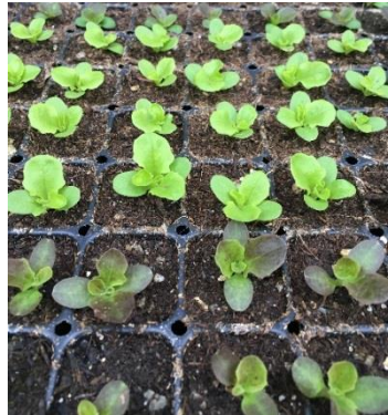
Lettuce seedlings at Mountain Heartbeet

◆ Pasture-raised beef, Integrated Pest Management on veggies.