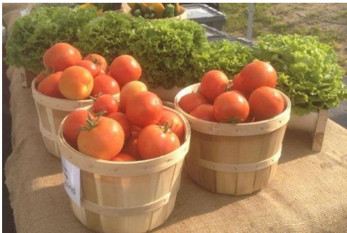
White Gates Farm

Chestnut Meadow Farm DeVylder Farm DiFilippe Farm & Greenhouse Grand View Farm Lucy Brook Farm Mountain Heartbeet Pork Hill Farm Sherman Farm White Gates Farm