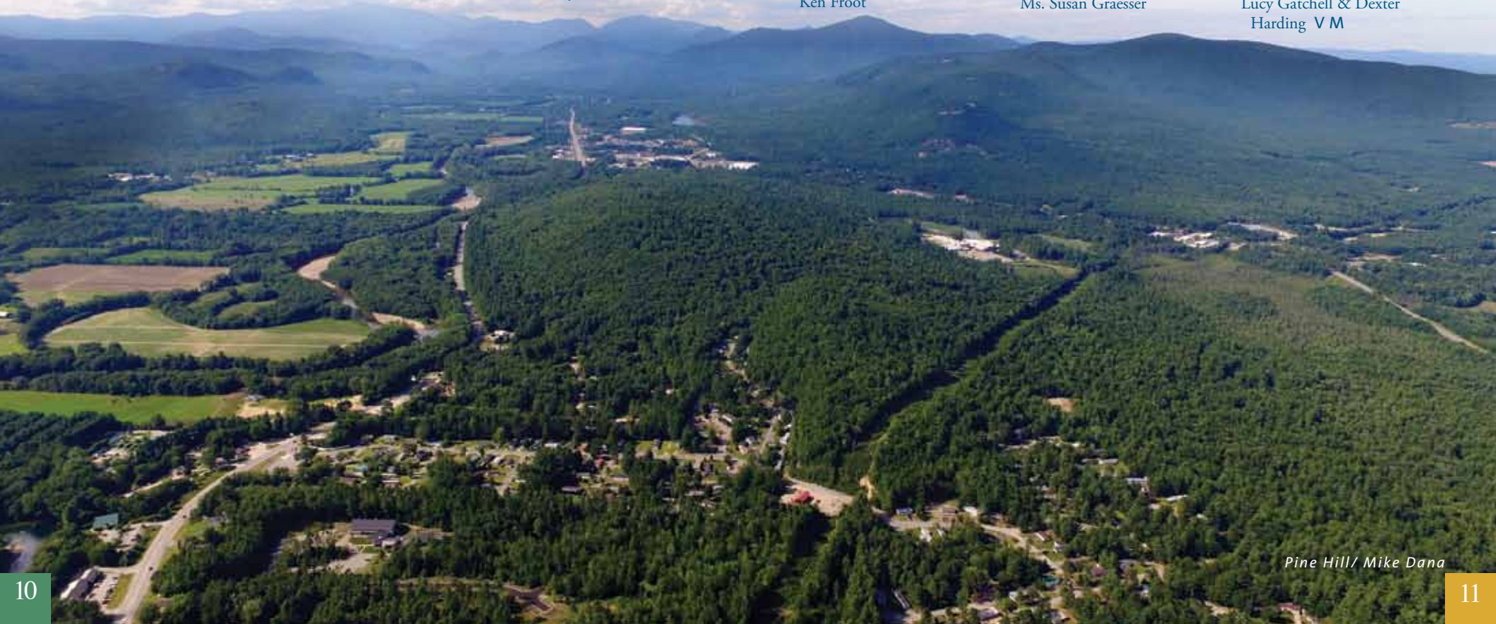
Pine Hill