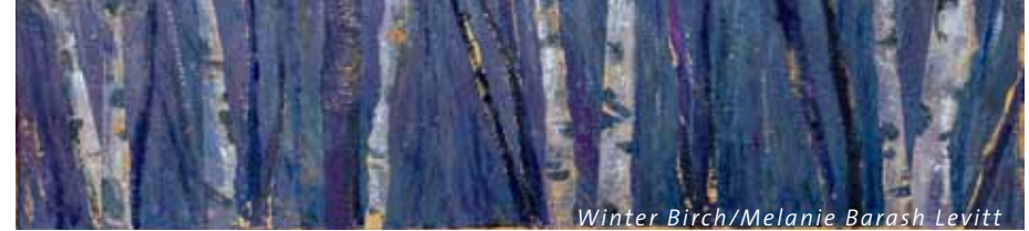
Winter Birch/Melanie Barash Levitt

Unrestricted funds may be used for day to day operations. Temporarily restricted funds are grants and donations for a specific project or purpose to be used in the future. Permanently restricted assets include land, easements and stewardship endowment. Non Current Assets represent Pledges that are receivable after one year.